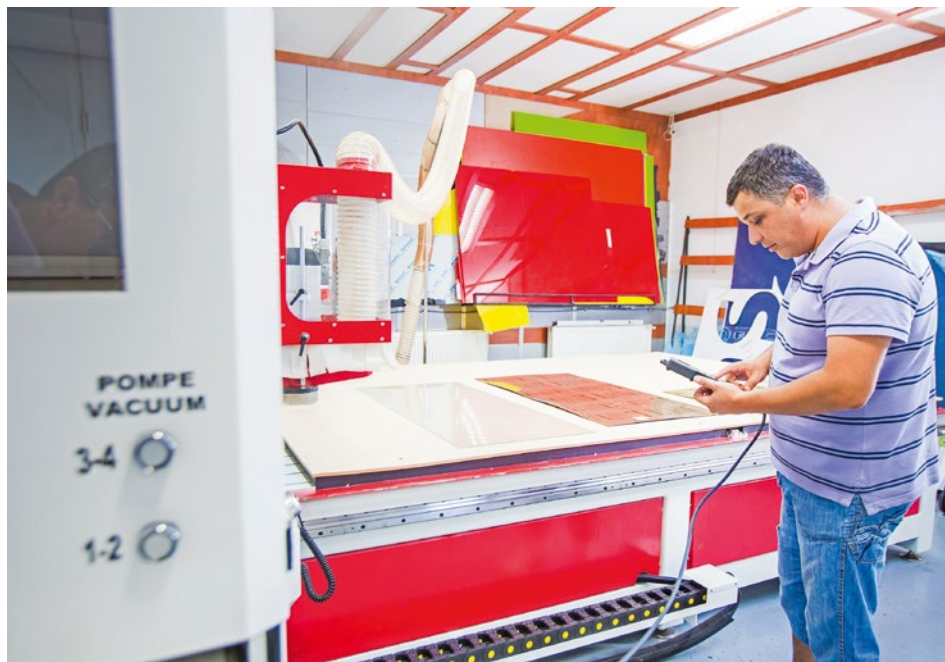
As part of the SME project in Romania, a company received a loan for purchasing a machine tool that automatically cuts 3D advertising products into size using modern control technology.

Eight years after the People and the Cantons approved the federal law on the cooperation with the Eastern European countries, the enlargement contribution has become an important part of Switzerland's European policy. Around 300 projects are currently being implemented. After CHF 1 billion had been committed to the EU-10 countries, all of the framework credit of CHF 257 million approved by Parliament for Bulgaria and Romania was also committed for priority projects by the end of November 2014. On 11 December, Parliament will discuss the framework credit of CHF 45 million to Croatia, which joined the EU on 1 July 2013. Of all the changes in the environment of the enlargement contribution, the appreciation of the Swiss franc has had the largest impact up to now.