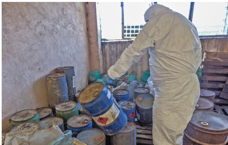
Today, around 4,500 tonnes of toxic pesticides are still stored in Bulgaria. The country will use the CHF 19.9 million from the enlargement contribution for disposing of these substances and to redevelop outdated warehouses.