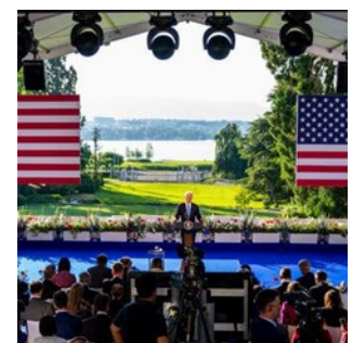
Press conference of US President Joe Biden with a view of Lake Geneva.