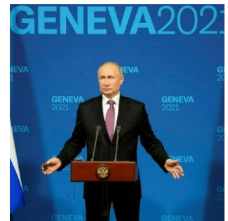
Russian President Vladimir Putin at his press conference in Geneva.