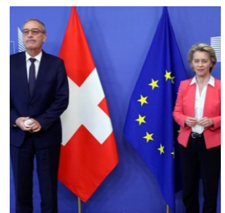
President of the Swiss Confederation Guy Parmelin meeting European Commission President Ursula von der Leyen for talks.