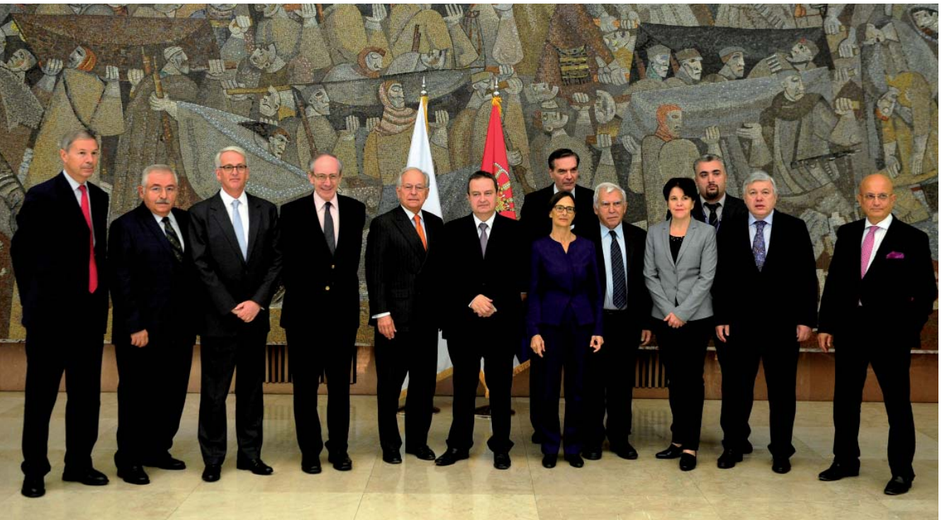
OSCE Chairperson-in-Office, Serbia's First Deputy Prime Minister and Minister of Foreign Affairs Ivica Dačić, with the members of the Panel of Eminent Persons in Belgrade, 2 October 2015.