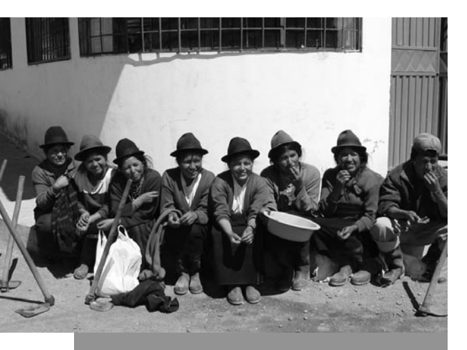
Unclear conflict situations – the example of the Ambato watershed in Tungurahua, Ecuador

A watershed is defined as an area where the rainwater flows into the same outlet. The example concerns a settlement area 50 by 30 km with approximately 40'000 inhabitants, who live and work in the Andes' highlands at an altitude of 2'500 to 3'000 meters above sea level.