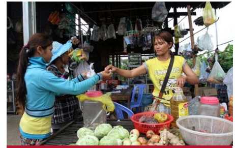
Small retailers benefit from rising standards of living, which in turn stimulates business, as in the village of Sambok in Cambodia.

taken a more discreet step, highlighted by attentive observers. At the insistence of several donors, including Switzerland, it is stepping up its collaboration with the United Nations by explicitly taking account of the 2030 Agenda and the Sustainable Development Goals (SDGs). The UN has welcomed the transformation of the IDA as "one of the most concrete and significant proposals to date" in meeting the demands of the Addis Ababa agenda with regard to the financing of the SDGs.