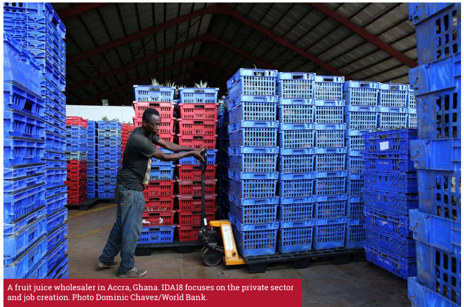
A fruit juice wholesaler in Accra, Ghana. IDA18 focuses on the private sector and job creation.

For the first time in its history, the part of the World Bank which provides the poorest countries with grants and loans will raise money on the capital market. The increase of available funds will contribute in particular towards financing the Sustainable Development Goals.