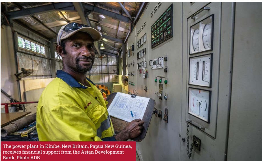
The power plant in Kimbe, New Britain, Papua New Guinea, receives financial support from the Asian Development Bank.

The AfDB indicated that its support of the private sector enabled the creation of around three million jobs in the period 2013–15. It is often difficult to measure the direct impact in this area as job creation depends on a number of interdependent factors. In Malawi, for example, the ADF supported a rural development programme which sought to enhance the business activities of some 12,000 beneficiaries, including by helping the poorest to organise themselves economically. The programme created around 3,000 jobs and stimulated economic activity by establishing or strengthening 354 enterprise groups and 10 cooperatives, according to the ADF.