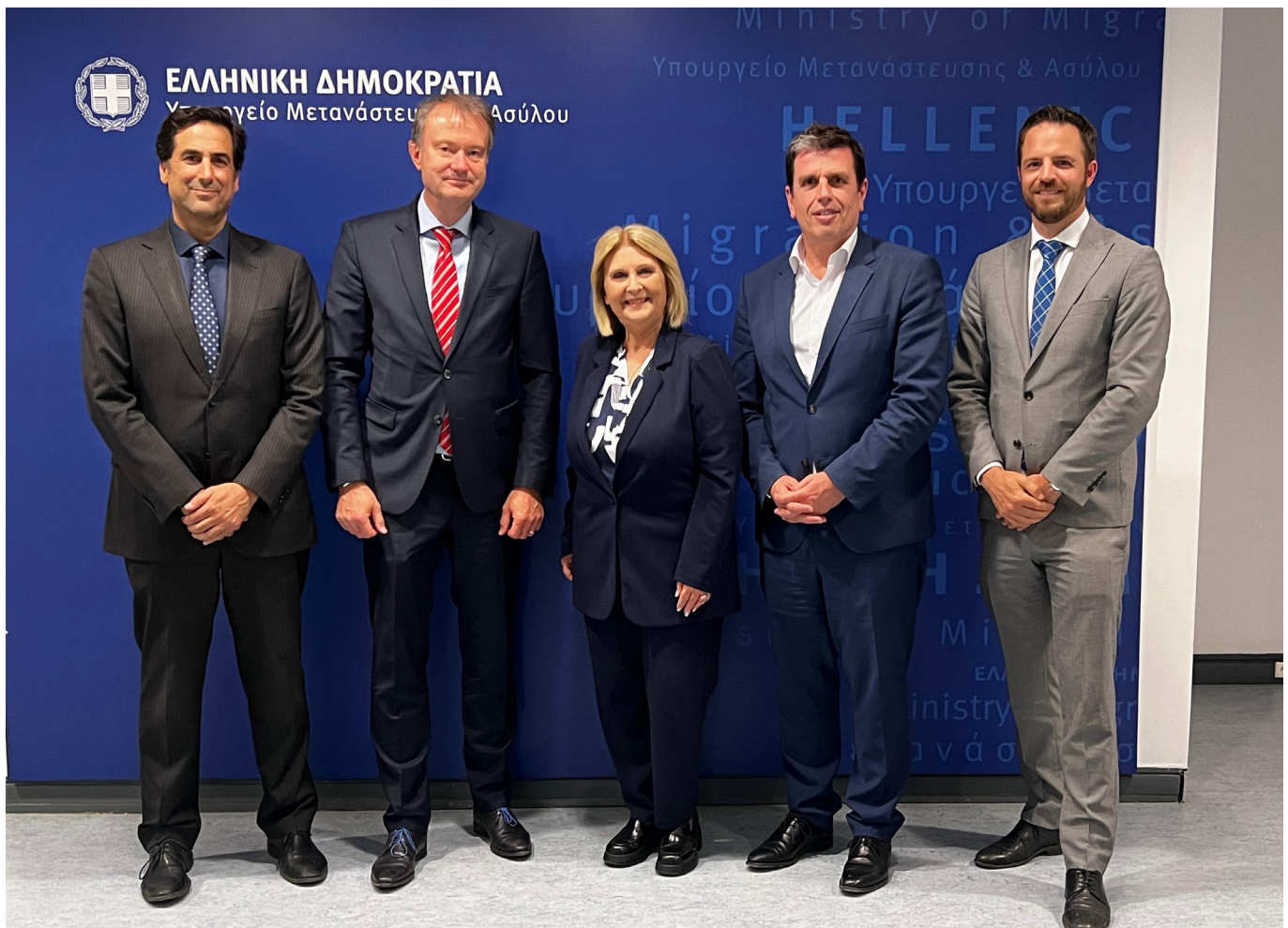
Minister of Migration and Asylum, Dimitrios Kairidis, and Ambassador Stefan Estermann signing the agreement for the "safe areas" project

The project aims to support early integration measures in the labor market for refugees, migrants, and asylum seekers. This approach involves collaboration across state, industry, and social actors. The project focuses on providing education and training, facilitating connections between employers and job seekers, and transferring vocational training expertise from Switzerland to Greece. This multi-stakeholder approach not only addresses immediate integration challenges but also lays the groundwork for long-term societal and economic benefits, aiming to promote integration and social cohesion.