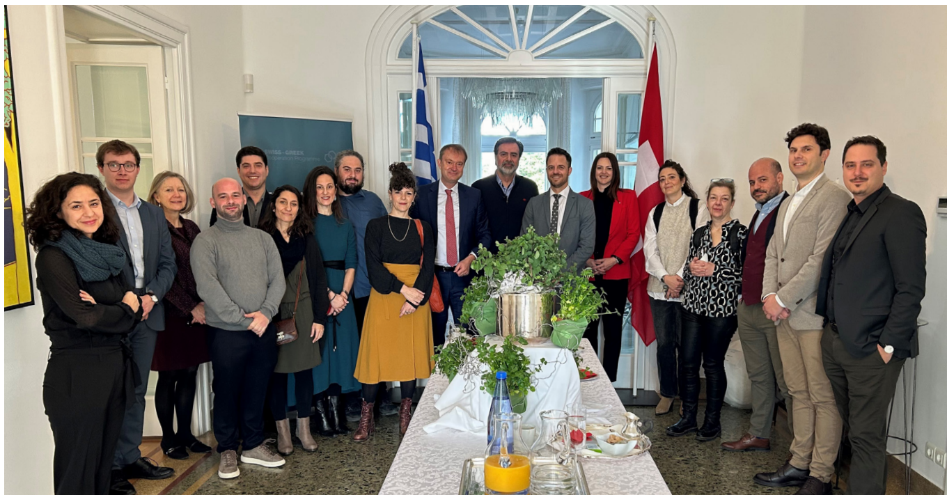
Participants of the Roundtable and Networking event