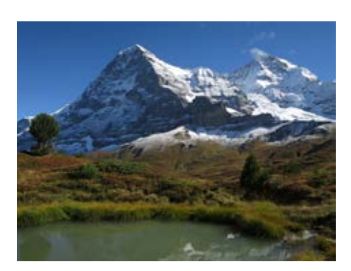
Switzerland can offer valuable experience that may inspire others. It has a vested interest in finding durable solutions to global climate and environment challenges that will allow safeguarding its key economic assets. To see are the Bernese alps in Switzerland: Eiger, Mönch and Jungfrau. © SDC

The GPCCE mobilises this thematic expertise and knowhow in order to support partner countries in the development of innovations and the design of national or regional guidelines and policies. It engages in partnerships with key stakeholders from the public administration, the private sector, academia and civil society to influence the development and implementation of policies, norms and standards at the national, regional and global levels. The GPCCE contributes to the definition of Switzerland's positions in international negotiations, policy dialogues and multilateral institutions and initiatives with the aim of promoting solutions that are practicable for LICs and LMICs and that can be widely applied in different regions of the world.