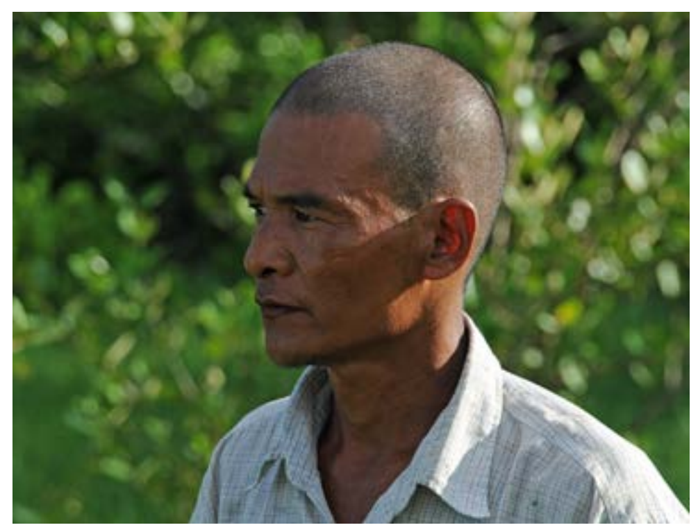
Farmer in the Irrawady Delta in Myanmar

The team at head office is constituted of 13 employees or 10.35 full time equivalents (FTE). At the time of publication of this framework, no major changes in human resources allocation for the GPCCE are foreseen. In addition, three Heads of International Cooperation manage the global cooperation offices in the embassies in Beijing, New Delhi and Lima. In case financial resources increase, there will be a need for reviewing staff composition. The possibility of placing National Programme Officers (NPOs) or regional advisors in embassies or Swiss cooperation offices shall be envisaged if there is a strong regional orientation of the GPCCE programme (e.g. Latin America, Sub-Saharan Africa, South-East Asia).