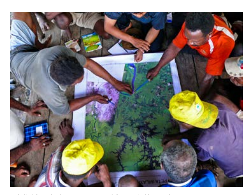
Multidisciplinary landscape assessment to define sustainable natural resource management options. Assessment of local perceptions on important landscape and forest resources, Papua province/Indonesia.

The GPCCE will also regularly monitor and evaluate the risks linked to its portfolio. The latter include slow and insufficient progress in the international negotiations on climate change and environment, lack of political will of policy makers at national and regional levels to implement reforms and risks related to innovative financial models, new technologies and partnerships. In order to mitigate these risks, the establishment of well-functioning alliances with partners in and beyond Switzerland and the careful assessment of the feasibility of new initiatives as well as the buy-in from partner countries are crucial.